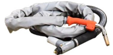
ErgoMax Source-Capture Fume Extraction Guns & Accessories

CALL YOUR REPRESENTATIVE TODAY TO FIND THE RIGHT SYSTEM FOR YOU!